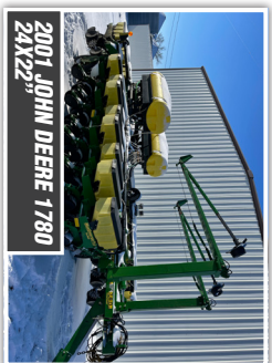
2007 JOHN DEERE 1780 24X22"