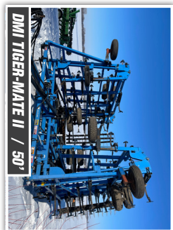
DMI TIGER-MATE II / 50"