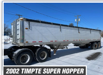
2002 TIMPTE SUPER HOPPER