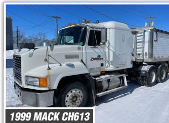
1999 MACK CH613