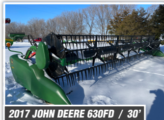
2017 JOHN DEERE 630FD / 30'