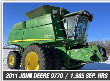
2011 JOHN DEERE 9770 / 1,985 SEP. HRS