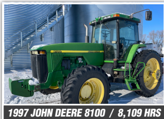
1997 JOHN DEERE 8100 / 8,109 HRS