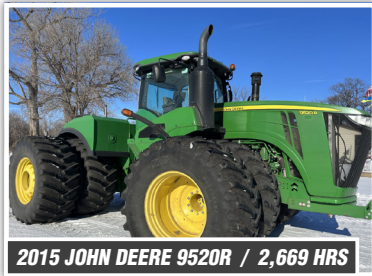
2015 JOHN DEERE 9520R / 2,669 HRS

or Brad Olstad at Steffes Group, 701.237.9173 or 701.238.0240