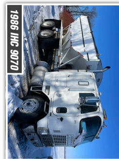
1986 IHX 9070