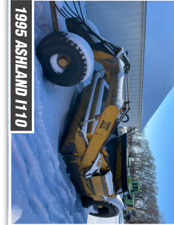
1995 ASHLAND 1110

1995 Ashland 1110 pull-type scraper, 11 yd., hyd. push-off, dolly front, 16.5L-16.1 front tires, 18.4-26 rear tires, SN117734 John Deere 9300 press drills, (3) 10' sections, rear folding, Erskine EZ drill hitch, hyd. markers, black press wheels Toro Groundsmaster 328-D lawn tractor, diesel, hydca, 72" front deck, hyd. deck lift, 3,476 hrs, SN30626-210000345 Land Pride Commander rotary blawing mower, 15', double wing, 1000 CV PTO, safety chains, 24x7' aircraft tires John Deere 300P open conveyor, 48'X20", steel chain, on transport Open conveyor, 55'X20", steel chain, on transport Full floor aeration, for 24' diameter bin