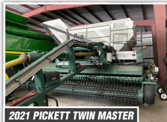
2021 PICKETT TWIN MASTER