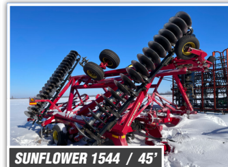
SUNFLOWER 1544 / 45'