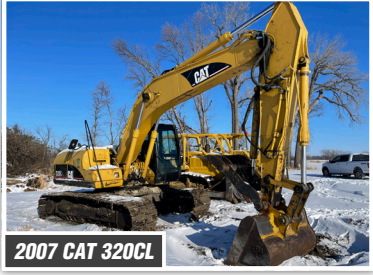
2007 CAT 320CL