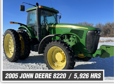
2005 JOHN DEERE 8220 / 5,926 HRS