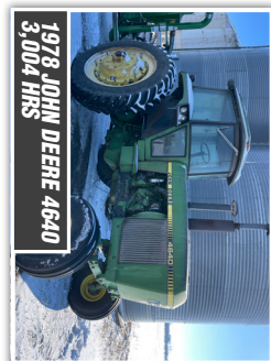
1978 JOHN DEERE 4640 3,004 HRS