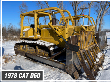
1978 CAT D6D