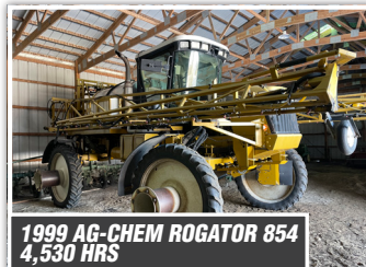
1999 AG-CHEM ROGATOR 854 4,530 HRS