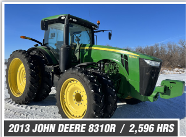
2013 JOHN DEERE 8310R / 2,596 HRS