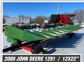
2000 JOHN DEERE 1291 / 12X22"